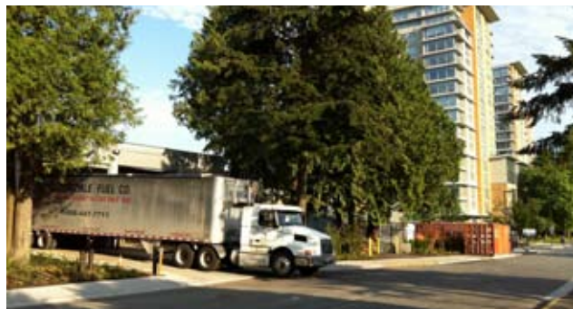
Cloverdale Fuel Truck