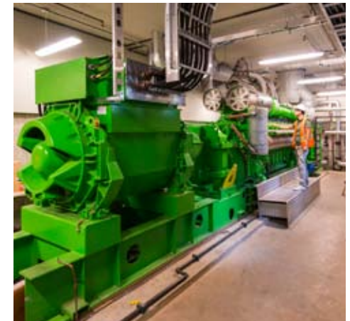
GE Jenbacher Engine