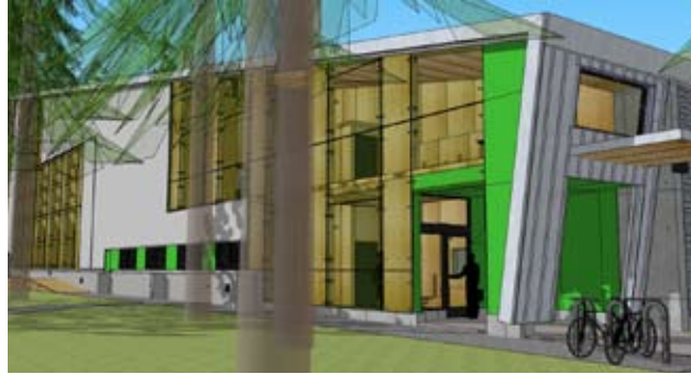
Original Architect Rendering