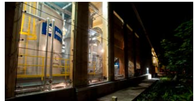
Gasifier at Night