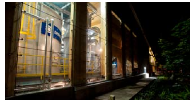
Gasifier at Night