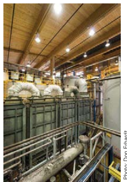
UBC's Bioenergy Research and Demonstration Facility also demonstrates the will not be widespread, benefits of building with wood.

Various experts in the bioenergy sector agree that competition for fibre and is not imminent.