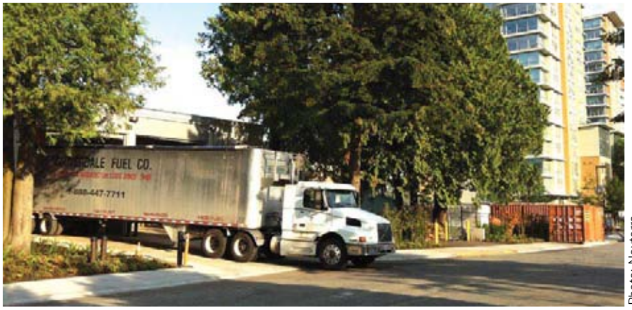
A local fuel supplier delivers urban wood waste to the BDRF two or three times a day.

Using Nexterra's proven gasification technology platform and innovative gas clean-up and thermal cracking solution, the system converts locally-sourced waste wood into a clean, reliable gas that is suitable for use in a high-efficiency, industrialscale gas engine to produce heat and power. According to Nexterra, the system will deliver electrical efficiencies that are 25% higher than traditional methods for producing biomass-based electricity at this scale.