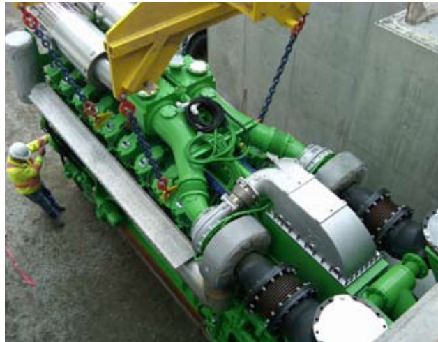
Installing GE Jenbacher Engine at UBC