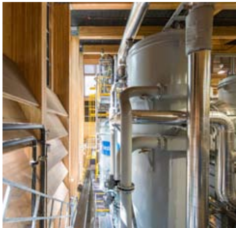
Walkway - Oxidizer to Gasifier