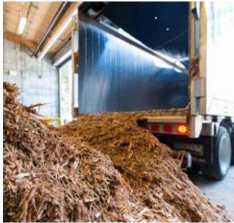
Truck Unloading Fuel