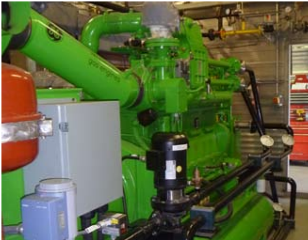
239 kW e Jenbacher Engine at PDC

The successful start-up of the system at UBC represents the culmination of more than four years of product development work and collaboration with GE’s Gas Engines Division. Prior to installing the 2 MW gas engine at UBC, Nexterra successfully completed more than 5,000 hours of trials at its Product Development Centre (PDC) in Kamloops, BC, including over 3,000 hours utilizing a 239 kW e Jenbacher engine.