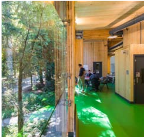
Entrance Work Area