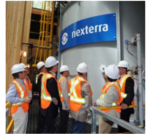
Nexterra Board at Gasifier