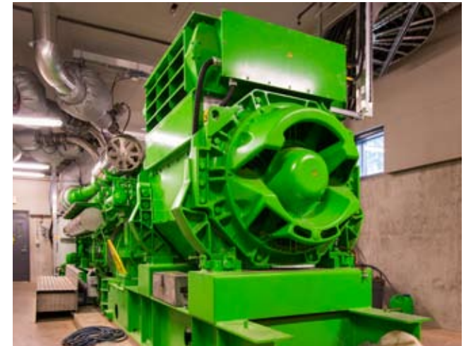
Engine at UBC CHP Plant