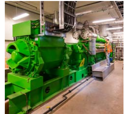
GE Jenbacher Engine