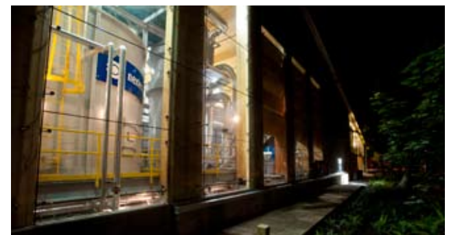
Gasifier at Night

Building Graphic: McFarland Marceau Architects