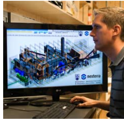
State-of-the-Art Controls System