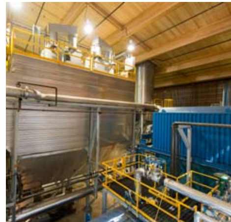
ESP and Boiler