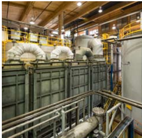
Syngas Thermal Cracking/Conditioning System